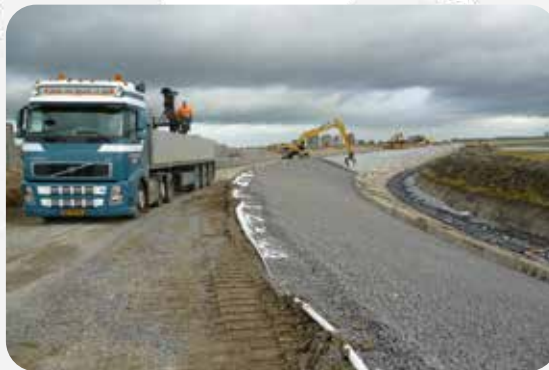
Slag applied in dyke construction