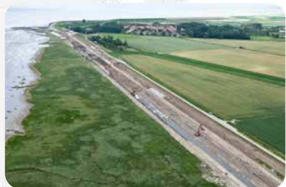
Slag applied in dyke construction